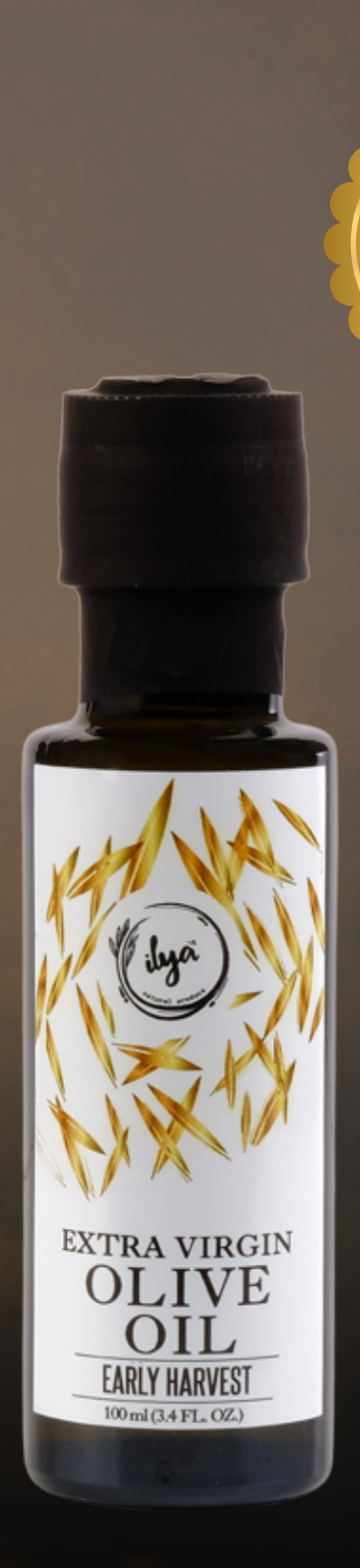
100 ML DORIKA BOTTLE