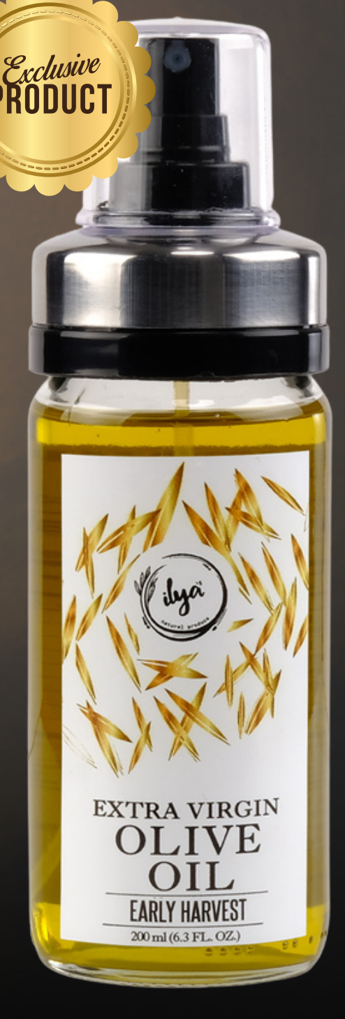
200 ML SPRAY BOTTLE