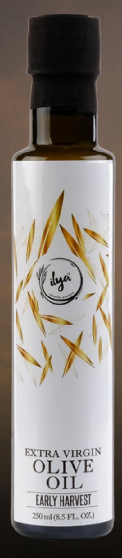
250 ML DORIKA BOTTLE